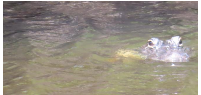
Oh, what big eyes you have!