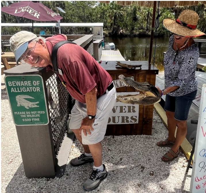
Hey, did you read that sign!