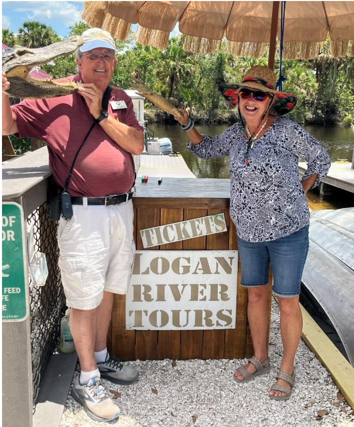
Ooooh, Lunch time