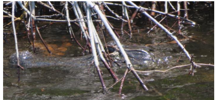
Did you see how long his nose is? That is a big gator.