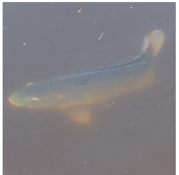
I'm ready to go fishing.