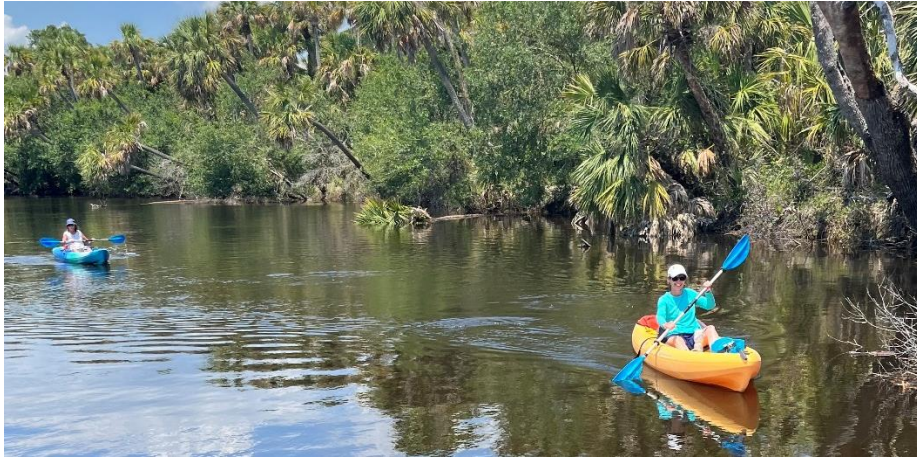
This is fun, think I'll take a swim, OR NOT!