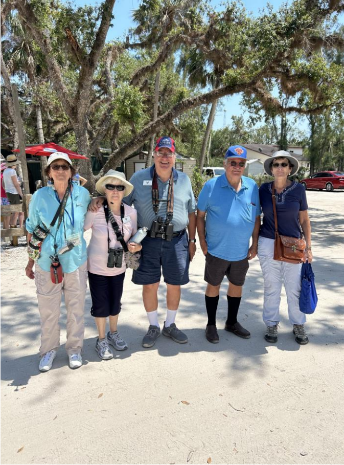
Gang's All Here