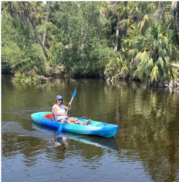
Sure is fun, I could do this all day long!